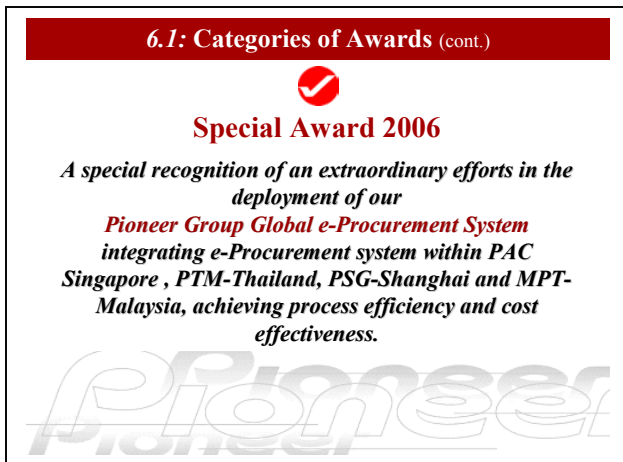
Special Award Category

Photo snippets taken during the Suppliers & Environmental Conference 2006: